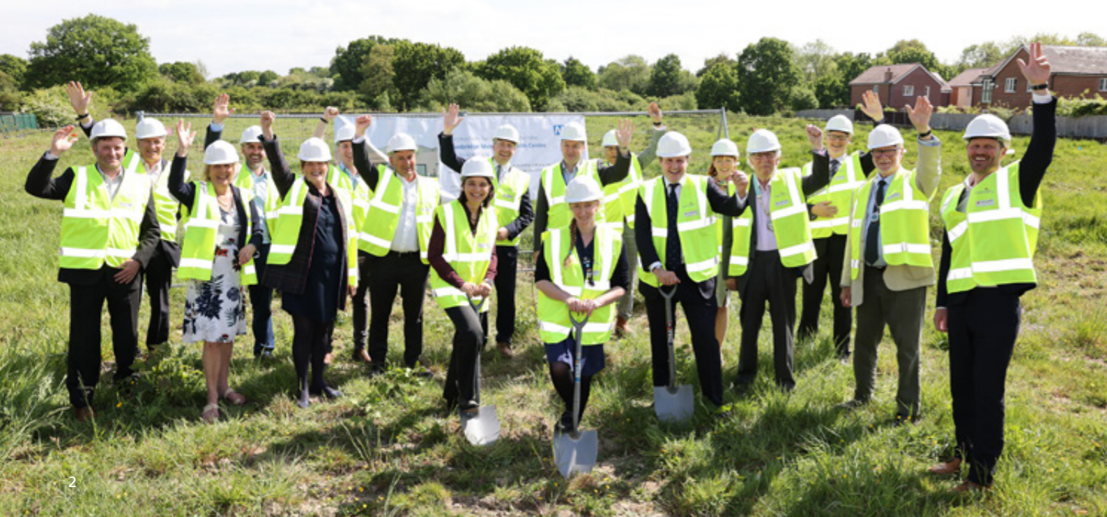
Breaking ground: We celebrate the start of work on the £13.5million centre in May 2022.